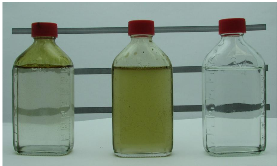
Feed, MOS tank and effluent samples from a system using Revive™ oily water membranes.